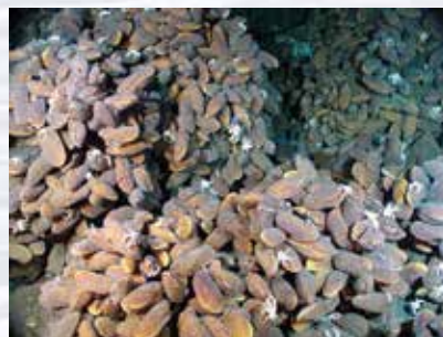
At NW Eifuku volcano, mussels are so dense in some places that they obscure the bottom. The mussels are ~18 cm (7 in) long. The white galatheid crabs are ~6 cm (2.5 in) long. Image credit: NOAA.

http://oceanexplorer.noaa.gov/explorations/04fire/logs/hirez/mussel_mound_hirez.jpg