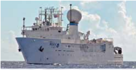
NOAA Ship Okeanos Explorer : America's Ship for Ocean Exploration. For more information, see the following Web site: http://oceanexplorer.noaa.gov/okeanos/welcome.html