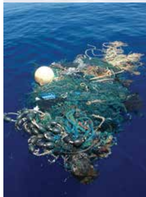
Although much of the debris concentrated in the "garbage patch" is composed of small bits of plastic not immediately visible to the naked eye, large items are occasionally observed. On Aug. 11, Scripps Institution of Oceanography SEAPLEX researchers encountered this large ghost net with tangled rope, net, plastic, and various biological organisms.

http://oceanexplorer.noaa.gov/explorations/04fire/logs/hirez/mussel_mound_hirez.jpg