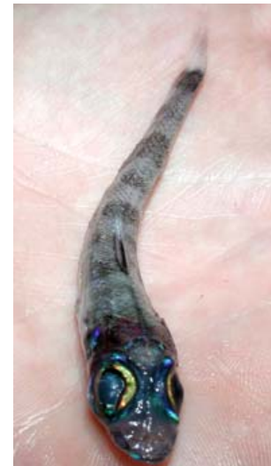
This deep-sea fish called a green eye exhibits a beautiful iridescent pattern around its large eyes and head.

Fish Community: The Lophelia coral habitat supports a diverse and distinctive array of fishes and invertebrates. One fish in particular, commonly called the coral hake, Laemonema melanurum , seems to be found only within the coral reef habitat. Its distinctive black fin markings contrast strikingly with the bland color pattern of its smaller relative Laemonema barbatula , which prefers the rubble field habitat. Other