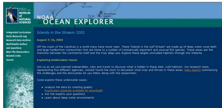
The introductory page for the Islands in the Stream 2002 section of the www.naturalsciences.org website.

The interactive website, www.naturalsciences.org , was designed and hosted by the North Carolina Museum of Natural Sciences (NCMNS) and was intended to complement the NOAA Ocean Explorer website. This website allowed students and teachers to follow the mission and ask questions of the educators and researchers at sea. Curriculum materials with six activities related to deep-sea exploration were also available for teachers to download. Some of these activities incorporated data from the mission, which meant that the students returned to the site frequently. Also included was a “meet the researchers” section that featured background information and research interests of the primary scientists. This section was designed to help change the image of a scientist as “a nerdy guy with wild hair and glasses in a white lab coat.”