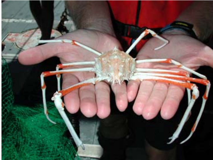
Spidercrabs, such as the one shown here, are very common perched atop the Lophelia bushes.

Invertebrate Community: Invertebrates seem to be the dominant inhabitants of the deep coral banks. Existing in enormous abundance, one small pink brittle star species inhabits the interstices of the coral matrix. When the manipulator arm of the JSLII hoisted a small coral bush into the collection