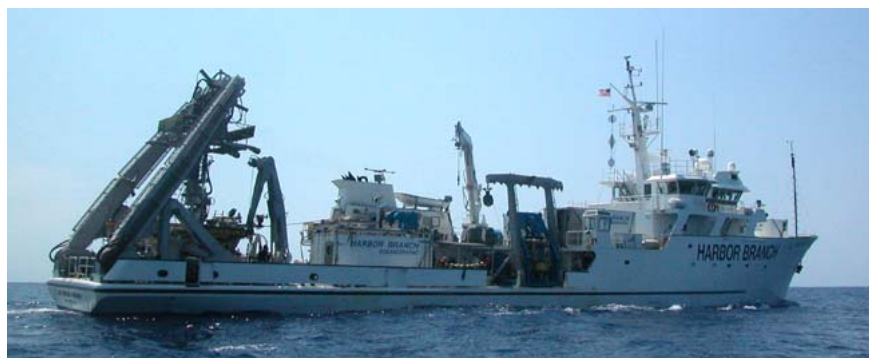
The Research Vessel Seward Johnson carries the scientific parties for the Islands in the Stream 2002 Expedition. Owned and operated by the Harbor Branch Oceanographic Institute, the vessel served as the platform for the Johnson-Sea-Link II submersible.

During this mission, the science party made much progress toward characterizing the northern Lophelia banks, as well as the shelf-edge hardgrounds, in terms of habitat, species, and ecology, and was able to collect enough visual information at the southern Lophelia bank to determine that the invertebrate and fish community was much different than the community found at the Lophelia banks only 80 km to the north. Overall, the habitat in these areas appeared to be healthy, with few exceptions, but there was evidence of fishing activity. Furthermore, observations made while transiting over extensive sand fields to target outcrops indicate that even small areas of outcrops or rubble provide habitat for numerous species. As with the first mission, scientists also observed numerous lionfish or turkeyfish ( Pterois