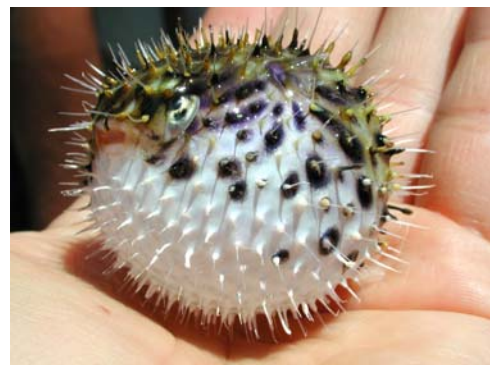
This tiny spiny puffer fish was found among the clumps of sargassum weed.

In order to sample all communities throughout the water column, considerable time was spent documenting animals in the uppermost surface layers. This layer is in constant motion as a result of waves, and is also constantly moving northward with the Gulf Stream. One unique habitat in the Gulf Stream surface waters is the sargassum complex. Sargassum is a brown algae that floats due to attached gas