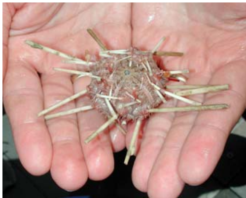
A catch of various organisms (top), and a pencil urchin, all brought up from the deep ocean using an Otter trawl.

Shipboard Sampling Operations: Members of the science party were split into three shifts to conduct complementary sampling operations 24 hours per day. Sampling occurred whenever the submersible was not operating, except for periods of rough weather. Shipboard sampling operations included: