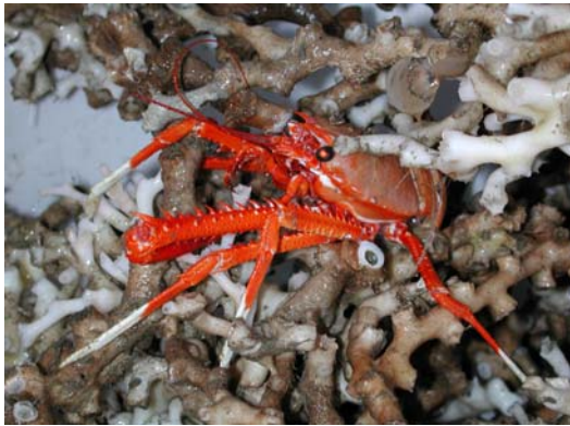
This galatheid crab was brought aboard the R/V Seward Johnson from 430 meters. It was found sitting within a mass of Lophelia coral.

Off North Carolina, Lophelia reefs occur along a series of narrow ridges along the 400-450 m depth zone. The reefs lie on the northern end of the Blake Plateau, an enormous layer of calcium carbonate sediment derived from the Caribbean. The initial larval coral colonist off the coast of Cape Lookout, NC probably settled on a patch of exposed hard substrate. Also important to early coral colonists were the existence of geological ridges along the continental slope. Such ridges generate local bottom current acceleration and local eddy fields, both important to filter-feeding coral colonies such as these. Once a colony was established, new bushes propagated from fragments that broke off and fell to the seafloor. Mature coral