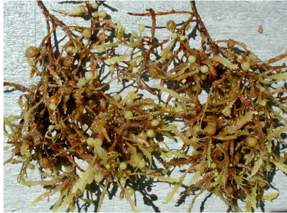
A close-up view of a small mass of sargassum weed.

Standardized sampling methods were used to sample the upper two meters of the water column. This involved pulling a small mesh frame net for 15 minutes in both open waters and waters containing sargassum. Dip nets and divers with underwater video cameras were also used when the weed lines of sargassum were thick.