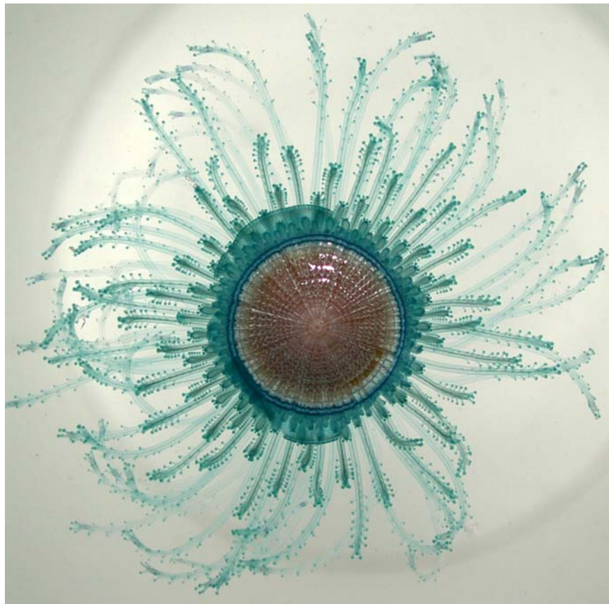
Related to the jellyfish, this Porpida porpida measures just one inch in diameter and floats feely in the water column.

Future studies by this group will continue to emphasize collecting basic biological and physical data. They plan to simultaneously locate and map the reef habitats while collecting relevant data on the inhabitants. These initial studies will lead to more sophisticated hypotheses of how these communities survive and will also lead to more sophisticated management.