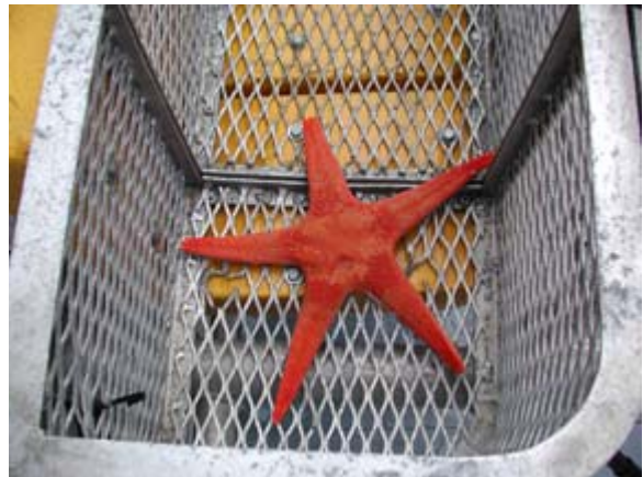
This red sea star was found in the Outer Shelf Hardgrounds area. It was one of the many items collected for further study and sits here in the collection basket of the JSLII .

The science party examined poorly-studied outer-shelf hardgrounds (80-200 m) and middle-slope deep coral (mostly Lophelia ) banks (400-500 m). Throughout most of the study area, these two systems were separated by only a few kilometers. While they share the similarities of being high-profile reef-like structures composed of hard substrates and overlain by the Gulf Stream, they appear to be vastly different in community structure and faunal interactions. There are however possible links between these two systems. Thus, these two "reef" types present a unique opportunity to compare/contrast paired systems in a logistically feasible sampling scheme. This work also allowed comparisons with some northeastern Gulf of Mexico study sites called the "Pinnacles", which are found at similar depths and share many of the same species as the North Carolina sites. The habitat structure of the Pinnacles, however, appears to be different, suggesting that the ultimate productivity of each system has a different base. The data collected will help support and document a proposed Marine Protected Area in this area off North Carolina.