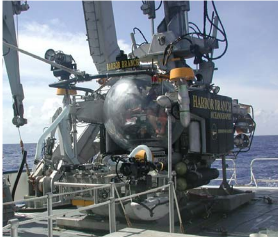
This submersible, the Johnson-Sea-Link II , was used for all of the dives conducted during this mission.

During the mission the target site locations were refined by performing transects of the area using the ship's single beam depth sounder. These data were logged directly into a computer for future bathymetric maps. Using the full GIS system that was aboard the ship, maps were being updated and new maps printed as the cruise progressed. Multiple passes over a site from various directions were required before choosing the final "best" target dive site. This strategy was also used when choosing sites to pull bottom gear (trawl, dredge) to avoid gear damage or loss.