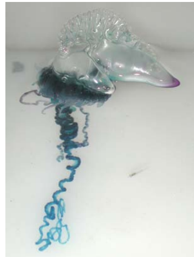
This very dangerous Portuguese Man-O-War jellyfish was caught during "night lighting" sampling.