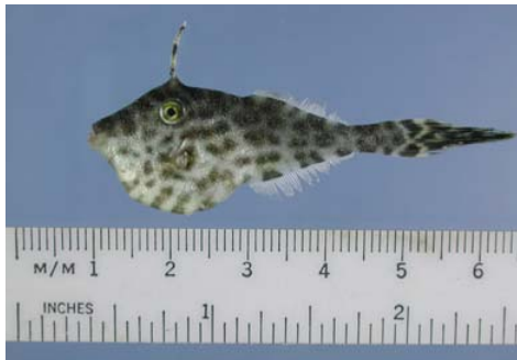
A juvenile scrawled filefish ( Aluterus scriptus ) found within the mass of sargassum. Its cryptic coloring helps it to avoid predators as it lives among the tangled mass of floating algae.

So far 62 fish species (not counting larvae) have been documented to use the sargassum off the coast of North Carolina. Most of these fishes are juveniles that use the habitat for feeding, while taking advantage of it to hide from predators. One of the most common and economically important fishes sampled were the dolphin fish ( Coryphaena spp. or Mahi mahi). Small dolphin fish live very close to the sargassum, and as they become larger they patrol in schools underneath the complex. Fishermen often look for the sargassum weed lines to improve their chances of catching dolphin fish. Amberjacks, filefishes, and triggerfishes are also dominant groups in sargassum. Flying fishes often take advantage of this floating, mobile, complex community. Sampling has shown that many species, especially larval forms, occur in the open water without sargassum, but the sargassum allows both large numbers of species as well as large numbers of individuals to be concentrated in small areas. The number of individuals that can be supported is directly related to the quantity of algae available.