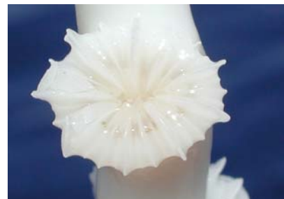
On top is a healthy branch of Lophelia coral sampled from the deep ocean reefs. Below is a close-up of the branch.