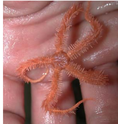
This brittle star is one of the many invertebrates that inhabit the Lophelia reefs.