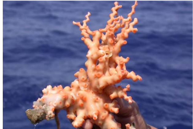
This beautiful pale orange coral was collected at the Lophelia coral banks off North Carolina. Very different from the surrounding pale white Lophelia, the scientists had never seen this type of coral before.