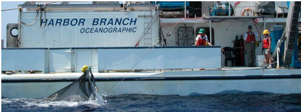
The large aluminum frame of the neuston net is 2 meters high and 3 meters wide. Here the net is being deployed off the starboard side of the R/V Seward Johnson . The yellow floats on top of the frame insure that it will not sink any lower that 1 m below the surface.

species, primarily dolphins, for stomach content and isotopic analysis.