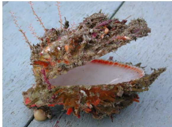
This deep-sea scallop shell was retrieved by the JSLII during a dive at an area off the South Carolina coast. Even though the scallop within the shell has died, the shell itself provides a home for bryozoans, tunicates, serpulids, and algae that grow upon it.

Ecology: The overall shelf-edge hardground community depends on both outside recruitment of larvae from other reefs as well as larvae produced locally (depending on the taxa). Recruitment dynamics are poorly understood but probably