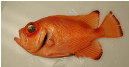
This Bigeye (top) is a common reef fish at these depths. The submersible crew also encountered groupings of Almaco jacks (bottom) swimming near higher relief areas of the Outer Shelf Hardgrounds.

Reef Morphology: The outer continental shelf hardgrounds were generally the most spectacular, with steep profiles often covering a vertical range of 10-20 m. These rocky systems offer very complex, bioeroded habitats with abundant coverings of attached plants (depending on depth) and invertebrates. Eroded, undercut ledges often present overhangs and caves that harbor many fishes. While not continuous along the shelf edge, these features are common along the southeast United States from Florida to almost Cape Hatteras, North Carolina.